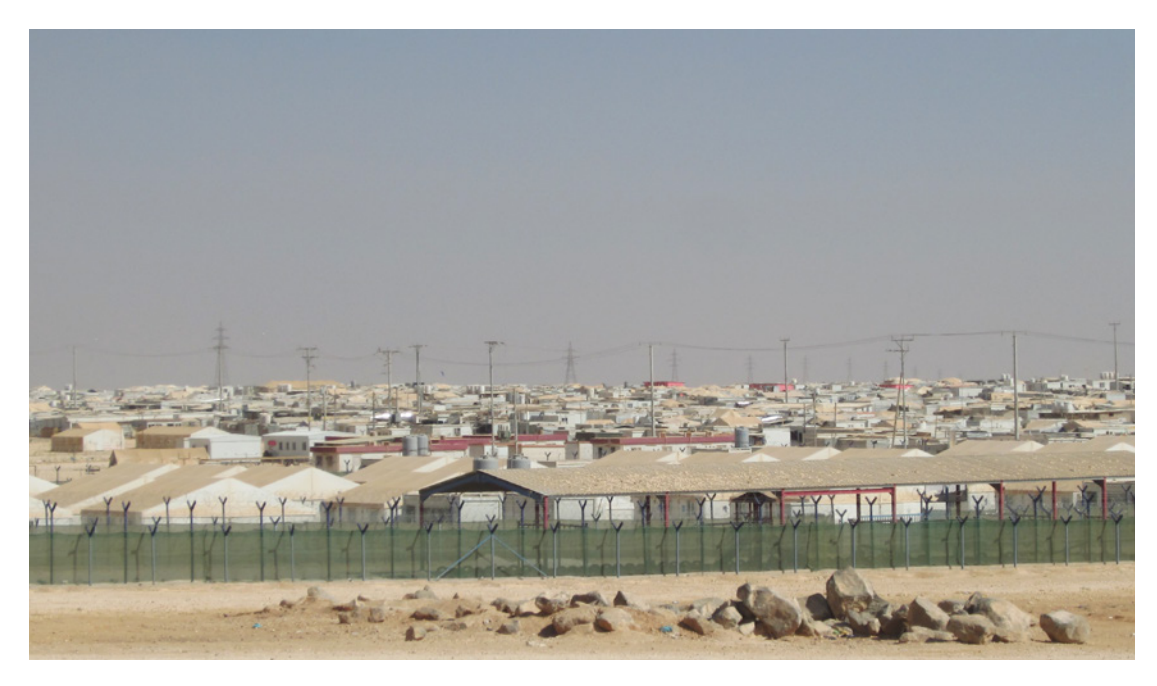
Za'atari Refugee Camp, Jordan

prioritised in 2014.<sup>21</sup> According to partners, in 2014, they were using Danida funding in 35 countries (including countries outside the priority crises where they were responding with flexible funds).<sup>22</sup>