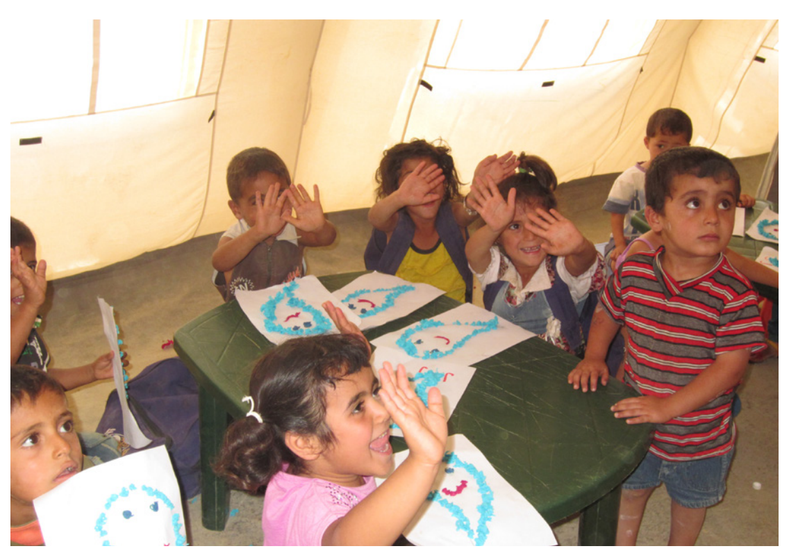
Children at school in refugee settlement, Lebanon

The evaluation found evidence that the Humanitarian Strategy remains relevant to the current humanitarian context. One indication is that, despite Danida granting its partners considerable flexibility in making programming decisions, in the comparative partner analysis, each organisation reported implementing a large number of the priorities (see Annex F). The case studies also provided evidence of the relevance of the Strategy. For example, planning documents for the response to the Syria crisis reflect a number of the priorities, particularly the focus on vulnerability, protection, linking emergency and longer-term approaches, and the promotion of innovation. The focus on vulnerability has been relevant in Afghanistan, enabling Danida to combine longer-term assistance to refugees and internally displaced persons (IDPs) with emergency assistance to those affected by natural disasters and conflict. In addition, the initial broad consultations in preparation for the WHS have identified targeting assistance to the most vulnerable, resilience and respect for international humanitarian law as some of the critical issues to be addressed (see Section 3.4 in Annex D).