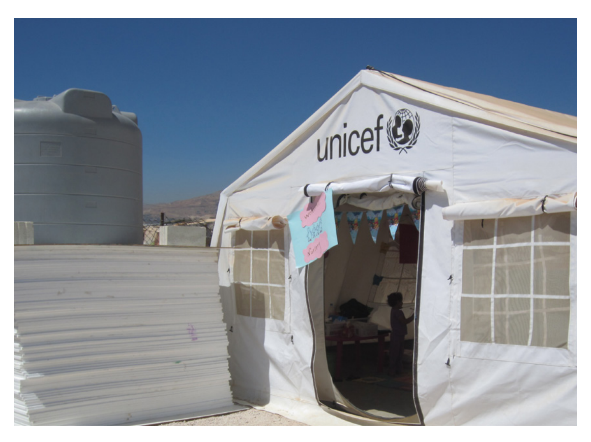
School in refugee settlement, Lebanon

Although Denmark has been extremely engaged in global-level policy discussions and with the boards of international organisations, currently, it does not have the capacity to be similarly active at field level.<sup>39</sup> The Syria case study highlighted that a lack of humanitarian field presence means that it was not engaged at country or regional level, even in the largest humanitarian crisis (although this is starting to change). Although Denmark has advocated on humanitarian issues during high-level visits to the region, partners strongly emphasised the need for it to engage in policy discussions and advocacy at country and/or regional level in order to balance the voices of more political donors. This would be an opportunity for Denmark to promote the principles of GHD, including the humanitarian principles and counter-balance the voices of more politicised donors. By contrast, Denmark was active in policy discussions and donor groups in South Sudan because there is a fragile states advisor with humanitarian expertise based in the country. This is an excellent example of what it can achieve with just one person, as long as the person has the right experience and profile. The Nairobi embassy also participates in humanitarian donor groups, focusing on Somalia and refugee issues in the Horn of Africa region, which is helpful.