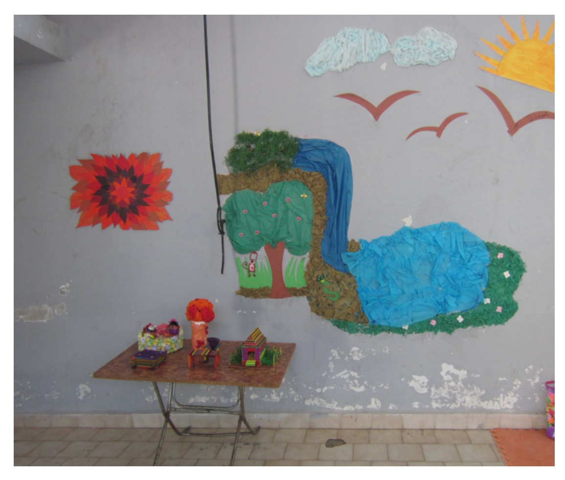
Children's artwork at informal learning centre, Lebanon