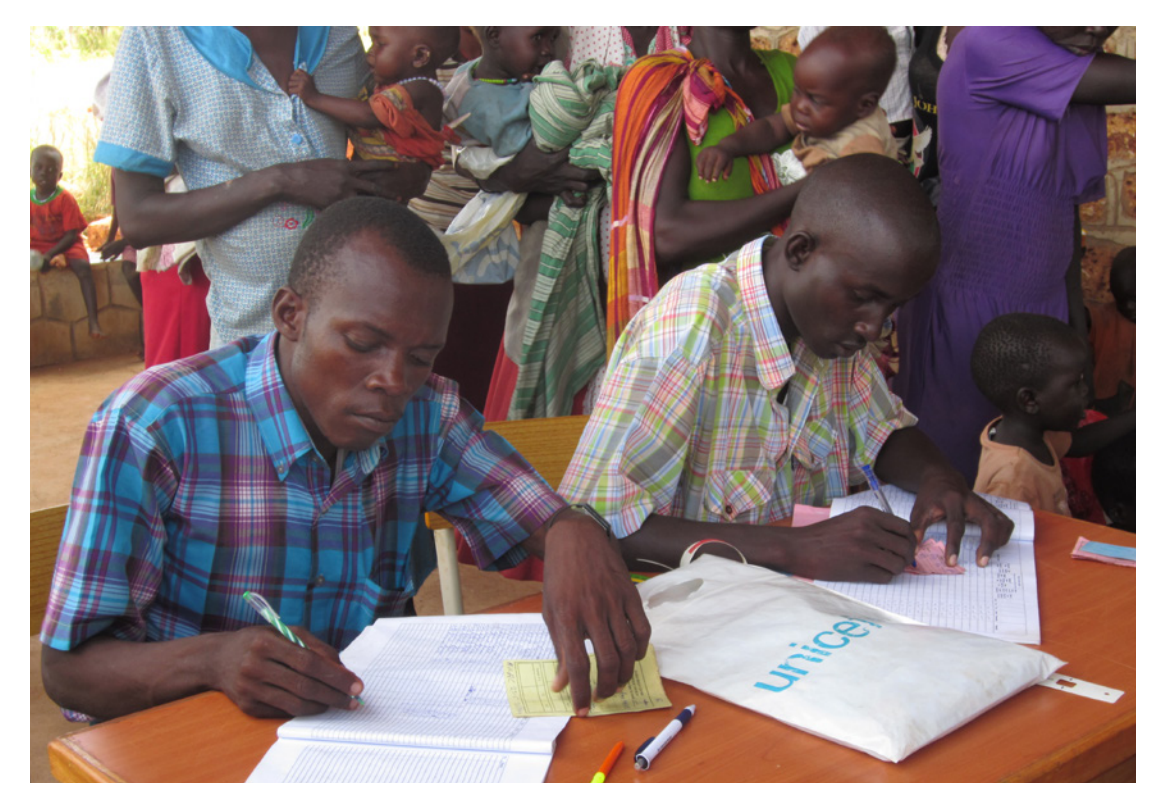
Registration at supplementary feeding programme, Wau, South Sudan