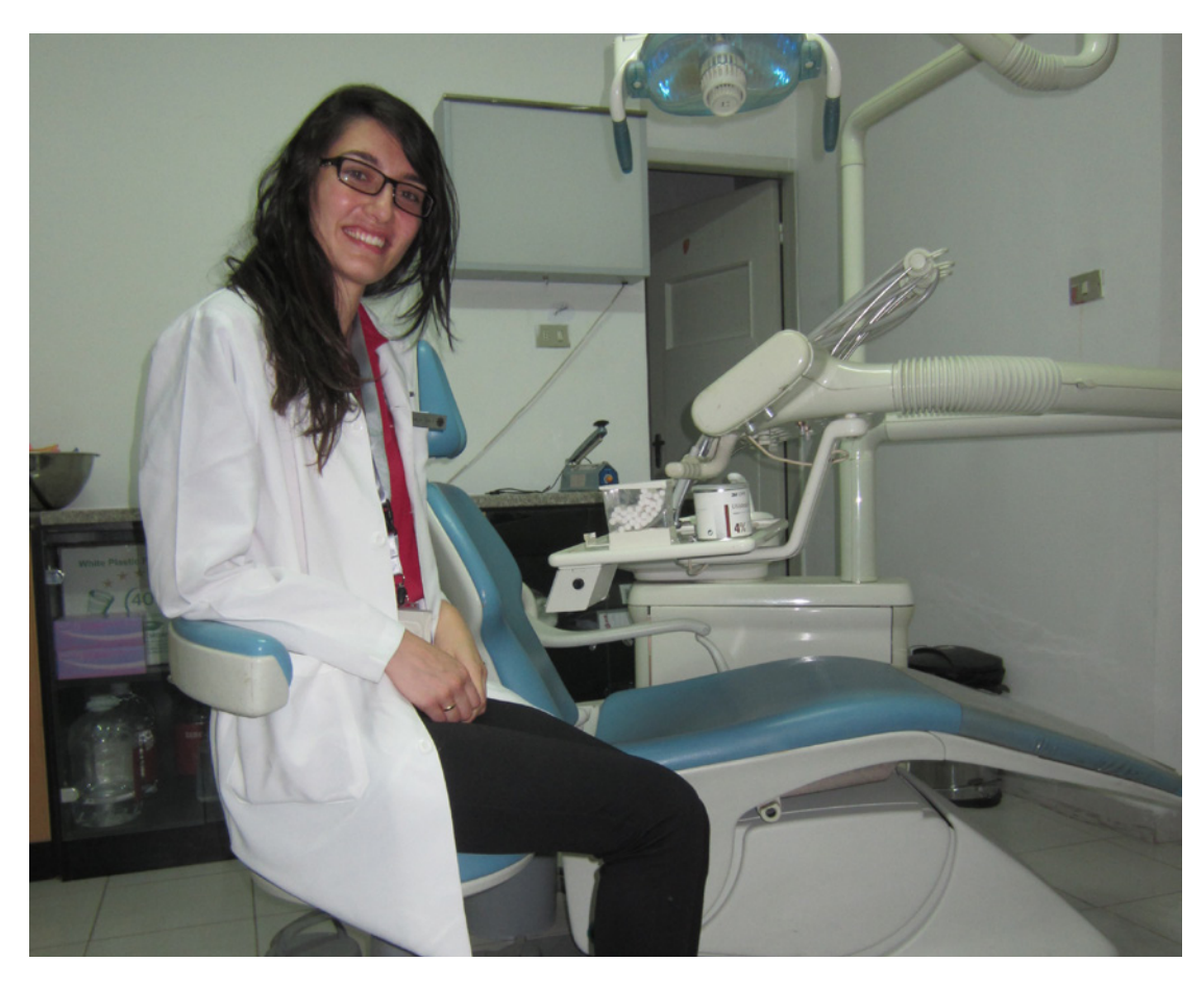
Dentist at Caritas Centre for Refugees, Amman, Jordan

Finally, partners value the fact that Danida is not simply a donor but a partner with which they can have honest discussions because its staff members are experienced and understand field realities and challenges.