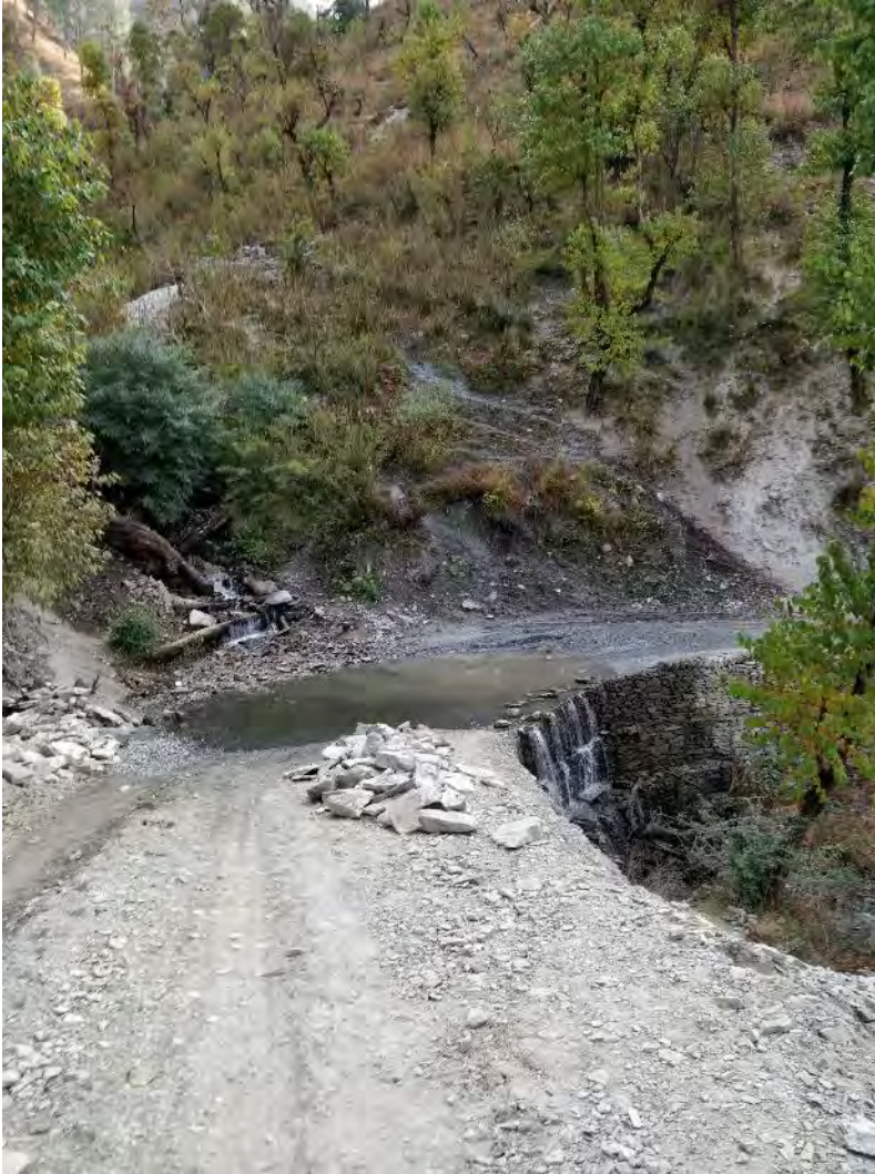
Photo 20. Chainage: 13+150. Lack of adequate cross-drainage creating waterlogging (Observation in December – relatively dry compared to monsoon season).

Pavement surface in certain section were too dusty (eg.1+250, 10+650) and rocky (10+200, 18+200). An appropriate solution should be applied in such areas.