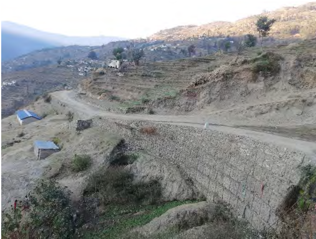
Photo 8: Chainage 14+000. Good example of good overall condition, road build, geometry and construction.

The present pavement surface is good and levelled in most of the sections. Bioengineering works have been completed in a few sections (e.g. 1+400 and 2+700) which are functioning well.