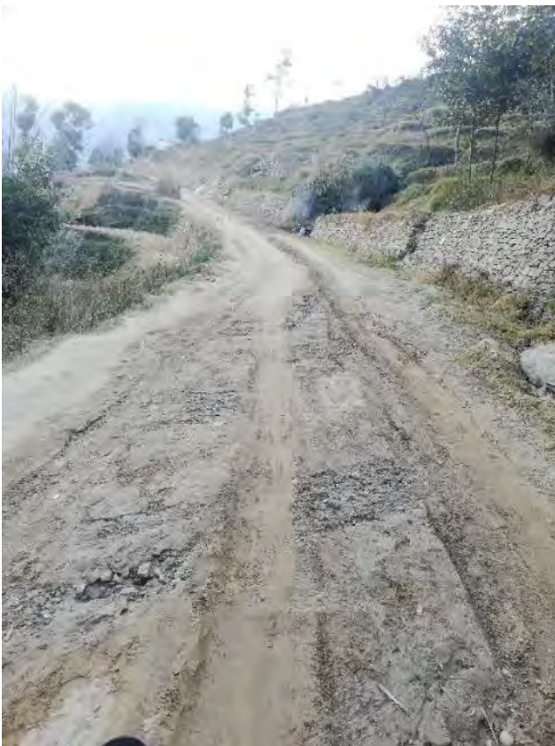
Photo 14: Chainage 15+480. Routine and recurrent maintenance activities to be performed regularly.