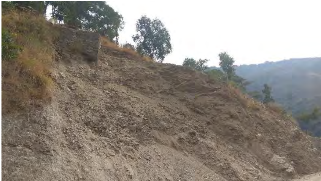
Photo 6: Chainage 3+850. Gabion wall on the verge of toppling/collapse