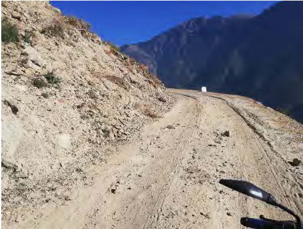
Photo 15: Chainage 12+000. Safety structures at steep curve should be considered.