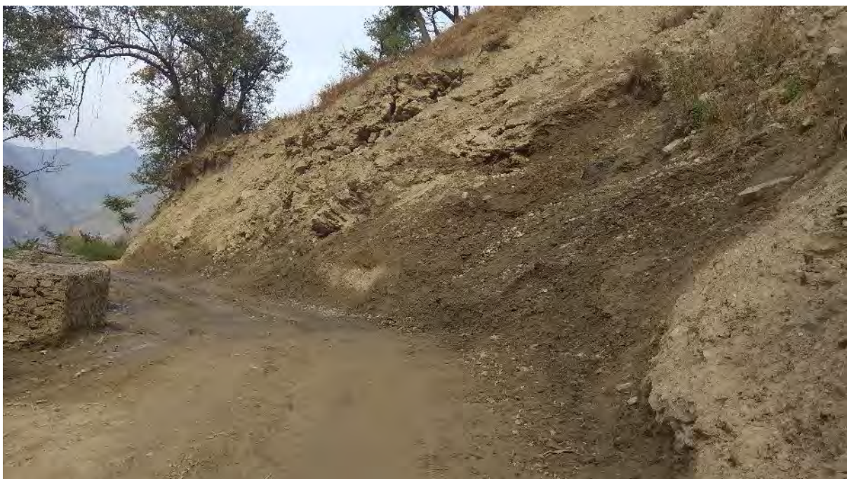
Photo 7: Chainage 4+410. Seepage from landslide which requires mitigating measures.