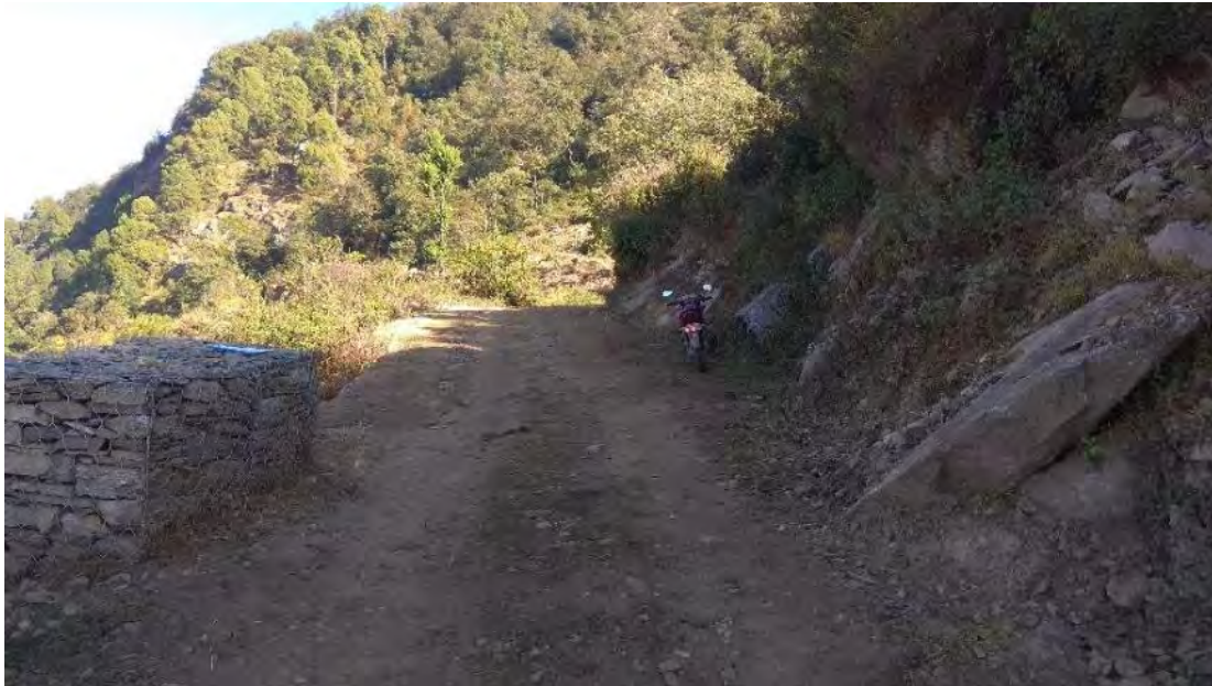
Photo 2: Width of 3.1m at chainage 13+000 where rock was not cut because movement may cause slope destabilisation