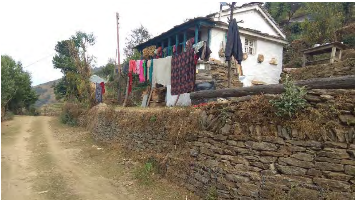
Photo 4: Chainage: 16+580. Gabion retaining wall for protection of settlements on the hillside provided.