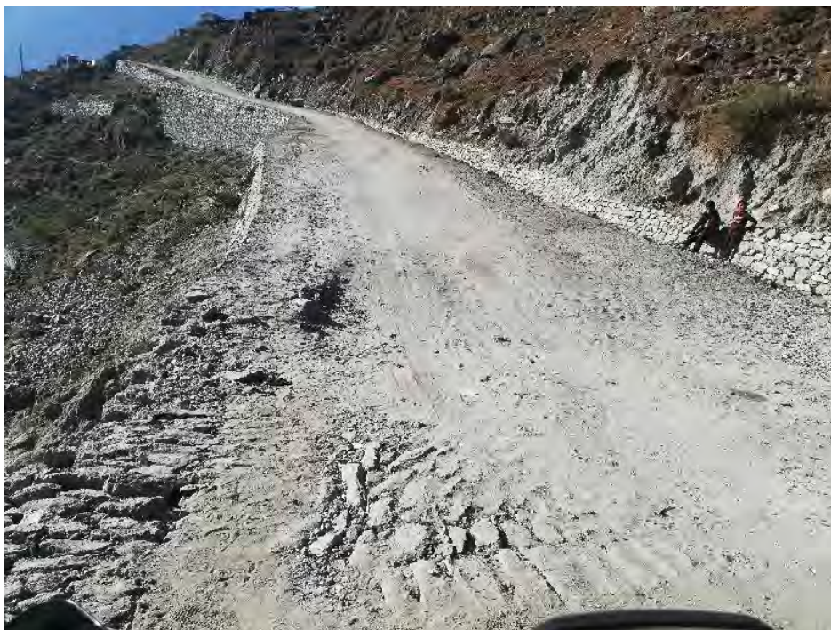
Photo 12: Chainage: 11+900. Cross-drainage water management structure has eroded and requires maintenance