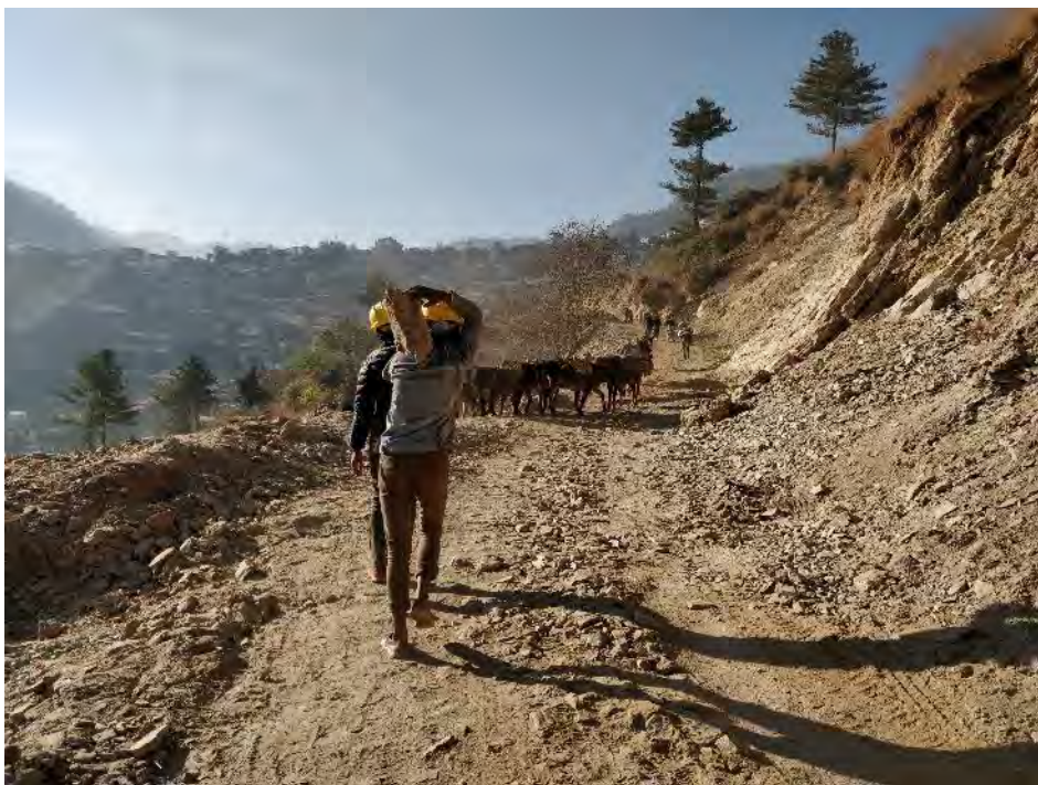
Photo 19: Chainage 0+900. Quarry site with potential landslide risks.

No side drain was seen along the road. Although not specified in design, drain should be provided in most of the sections. Although there were causeway structures, there were no appropriate road pavement completed in causeway areas for example (1+600, 9+980, and 13+150)