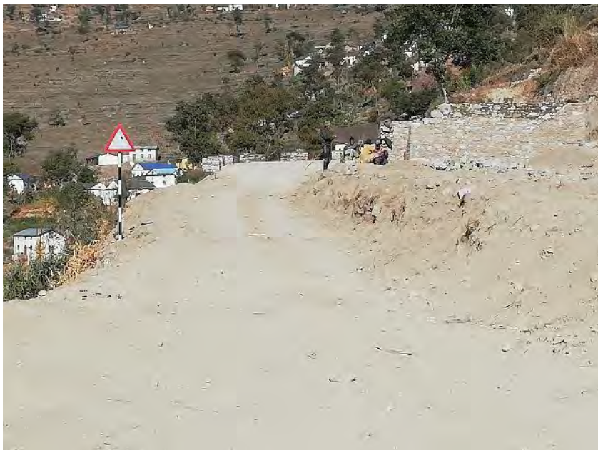
Photo 16: Chainage 8+200. Traffic sign not properly visible and requires fixing.