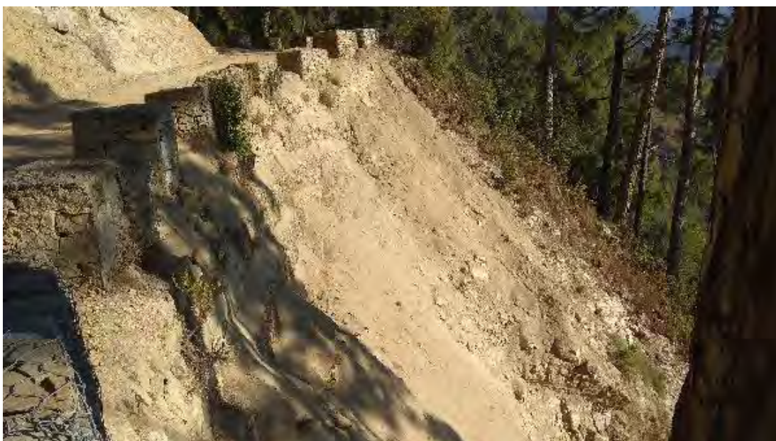
Photo 3: Chainage 14+250 to 14+270: Composite wall and crash barriers with minimal bioengineering works on slope