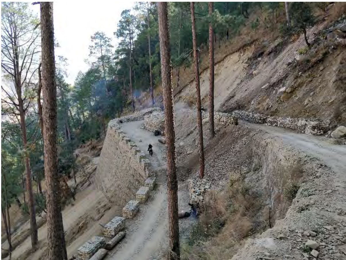
Photo 18: Chainage: 7+250. Good construction with adequate structures in place on steep terrain